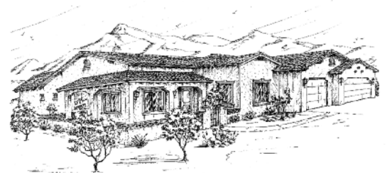
Santa Barbara Ranch