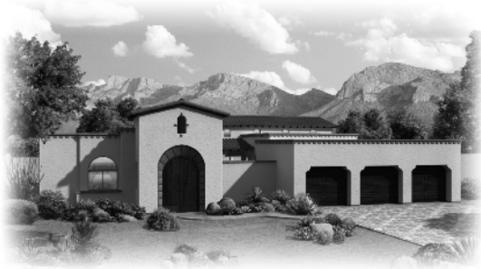
Santa Barbara Ranch