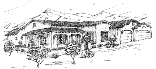
Santa Barbara Ranch