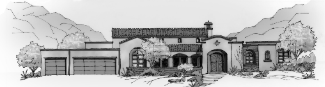
Spanish Colonial with Optional Casita