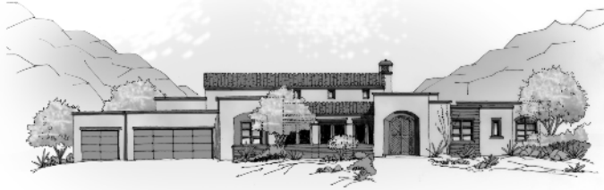
Territorial with Optional Casita