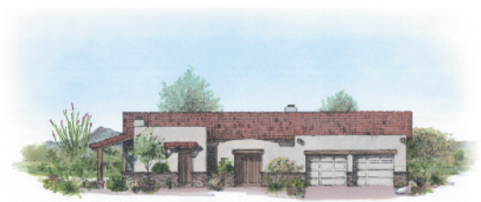
Elevation B Artist's Rendering