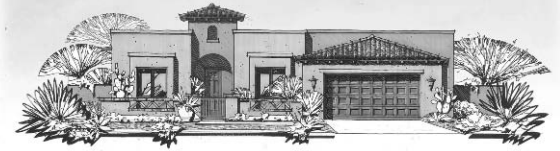
Elevation A Artist's Rendering