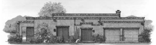
Elevation A Artist's Rendering