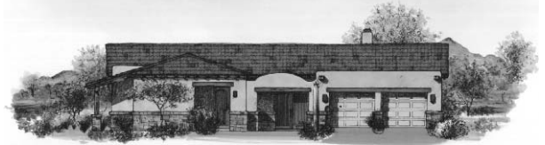
Elevation B Artist's Rendering